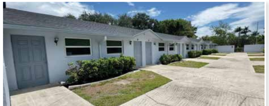
William H. Mann Place

Burckle Place: At our women's facility, we leveled and replaced the kitchen flooring for improved look and safety. We also added an extended patio umbrella in the back garden, creating a peaceful outdoor space where residents can find tranquility during their housing stay.