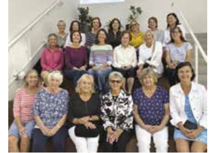
Seacoast Bank, Lynn University, Seasiders Community Service Group of Palm Beach Shores, and Palm Beach Opera Community Engagement program helping improve client lives.

Our incredible volunteer groups inspire and uplift us all through their efforts. Whether it is once a month, quarterly, or once a year, group days of service are incredibly beneficial in enriching the lives of our clients.