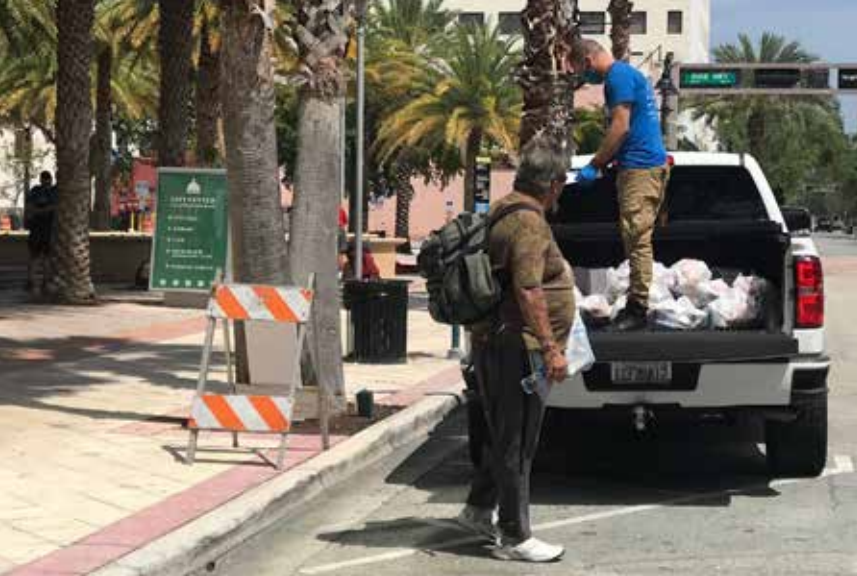
The Lord's Place Outreach and Street Engagement Team delivered shelf stable food to those living on the streets during the pandemic.