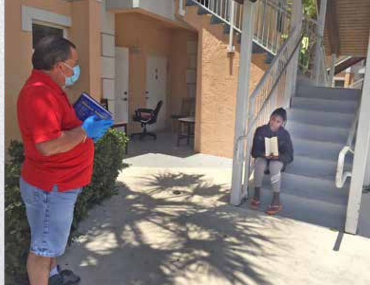
Even during the pandemic, and throughout distance learning, The Lord's Place Family Campus staff continued to support our students in a safe way.

The Lord's Place, with the help of our dedicated supporters, stepped up to the challenge of serving those in need during the pandemic. In the last three months of our fiscal year (March 14 –June 30, 2020) we... served more than 3,600 meals, conducted 1,800 housing case management sessions, provided 800 job coaching sessions and engaged with 235 new unsheltered individuals.